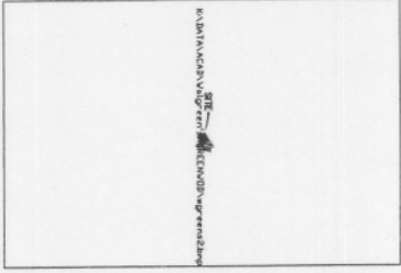
LOCATION MAP SCALE: 1" = 5000'

BEFORE YOU DIG SC 106 CALL 888-388-3888 THE PURPOSE OF THIS NOTICE IS TO ADVISE THE PUBLIC THAT THE STATE OF MISSISSIPPI HAS A REGISTERED SYSTEM OF UNDERGROUND UTILITY LINES. BEFORE YOU DIG, YOU MUST CALL 888-388-3888 TO OBTAIN A DIGGING PERMIT AND TO LOCATE ALL EXISTING UTILITY LINES. FAILURE TO CALL 888-388-3888 BEFORE YOU DIG MAY RESULT IN DAMAGE TO UTILITY LINES, PERSONAL INJURY, OR DEATH. THE STATE OF MISSISSIPPI IS NOT RESPONSIBLE FOR ANY DAMAGE TO UTILITY LINES, PERSONAL INJURY, OR DEATH RESULTING FROM THE FAILURE TO CALL 888-388-3888 BEFORE YOU DIG.